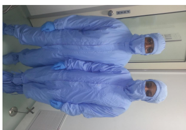
MCAZ inspectors during cGMP inspection of Sterile facility in India - May 2013